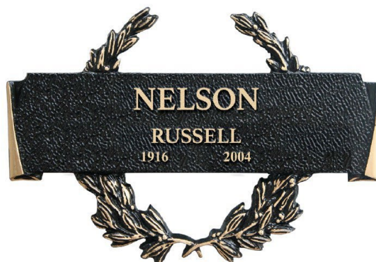
Year Dates - Single Name