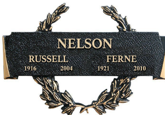
Year Dates - Two Names